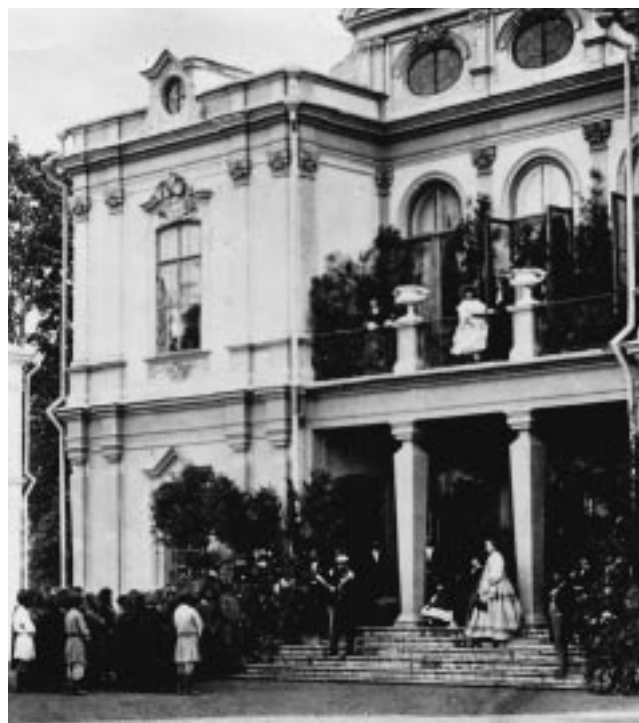
EMANCIPATION OF THE SERFS. On March 3, 1861, Tsar Alexander II issued his emancipation edict for the Russian serfs. This photograph shows a Russian noble on the steps of his country house reading the edict to a gathering of his serfs.

Nor were the peasants completely free. The state compensated the landowners for the land given to the peasants, but the peasants, in turn, were expected to repay the state in long-term installments. To ensure that the payments were made, peasants were subjected to the authority of their mir , or village commune, which was collectively responsible for the land payments to the government. In a very real sense, then, the village commune, not the individual peasants, owned the land the peasants were purchasing. And since the village communes were responsible for the payments, they were reluctant to allow peasants to leave their land. Emancipation, then, led not to a free, landowning peasantry along the Western model, but to an unhappy, land-starved peasantry that largely followed the old ways of farming. Comprehensive reforms that would have freed the peasants completely and given them access